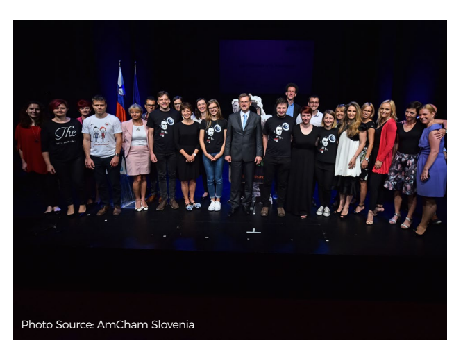
Employees from public and private sectors with former Slovenian Prime Minister Miro Cerar.

working groups. By changing mindsets, teaching and promoting cooperation, and strengthening the role of the individual, Partnership for Change has introduced the concept of innovative co-creation in Slovenian society in a way that did not exist before.<sup>2</sup>