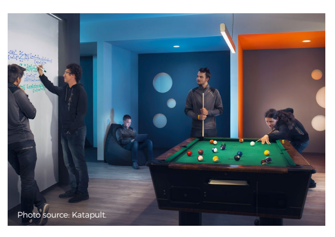
The facilities are modern and well adapted to the needs of young people. Member entrepreneurs can work on cutting-edge technology, such as robotics, creating areat added value.

Katapult offers unique support by providing and sharing Dewesoft's machinery and measuring devices. The devices provided by Dewesoft are then used by smaller companies, and can significantly accelerate the development and improve the quality of their products. Additionally, Katapult offers the necessary infrastructure (offices, meeting rooms, conference rooms, relaxation corners, and other facilities), knowledge (a pool of mentors, internationally