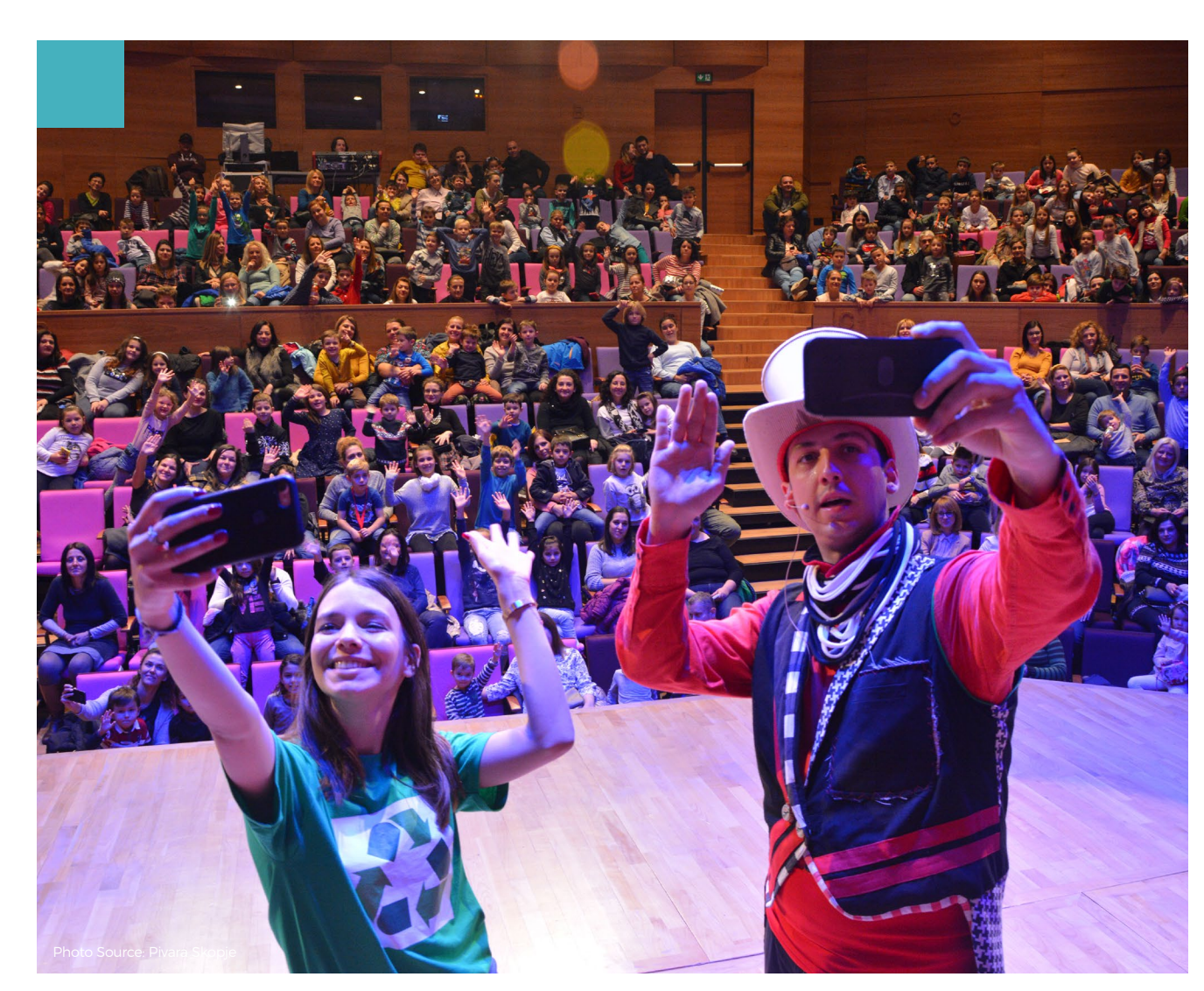
The platform "Are you Recycling?" has so far engaged more than 10,000 children.

The company also cooperated with central and local level governments, which must issue legal permits to set up the appropriate infrastructure for collection, selection, storage, and recycling of PW. Particularly significant cooperation with the government includes the implementation of communication activities and actions intended to raise public awareness.