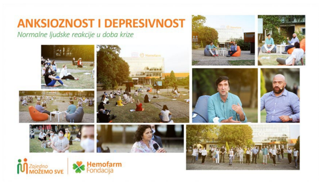
Nearly half a million people joined the antidepression movement with the help of a campaign shared through TV, YouTube videos, bloas, articles, and billboards.