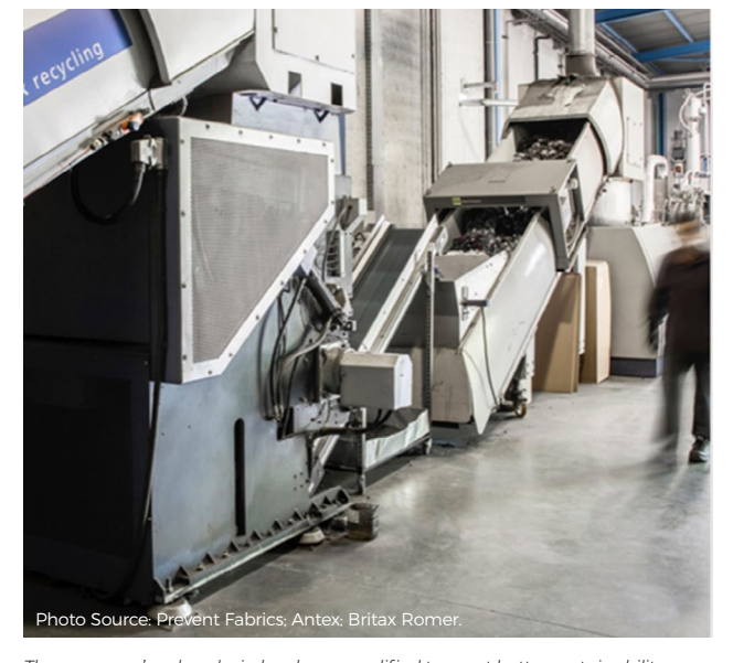
The company's value chain has been modified to meet better sustainability standards.

system to reduce the use of clean water. The company's annual water consumption for production needs is 91,570 cubic meters. It now uses lesser quality well water that would not be suitable for drinking but is sufficient for Prevent's technological needs. This water is further prepared and softened to the quality required for the production process.