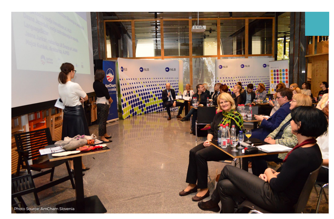
Employees from the public and private sectors tested their problem-solving skills.

In June 2015, the pilot project was launched, involving 27 employees, 23 companies, and the Ministry of Public Administration. Entering its 8th round in 2021, the program has reached 500 employees, 180 companies, and 30 ministries and public administration bodies. As the Partnership for Change is about cooperation and breaking down barriers