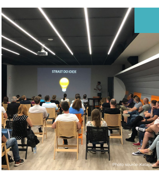
Gaining knowledge represents significant added value for young entrepreneurs trying to break into the market

Today, Katapult has 2,500 square meters of office space, production facilities, and meeting rooms. Some companies and entrepreneurs that joined the incubator operate in the building, some are part of the programs, and others come only for specific support to use machines or services offered by Katapult. There are currently 15 entrepreneurs in the Entities of Innovative Environment (SIO) program intended to increase the survival rate of start-ups, and 15 incubated companies or individual entrepreneurs operate in the building. Katapult also supports five to six teams annually under its Hardware program, a knowledge-exchange meant to increase the number and growth of startup companies